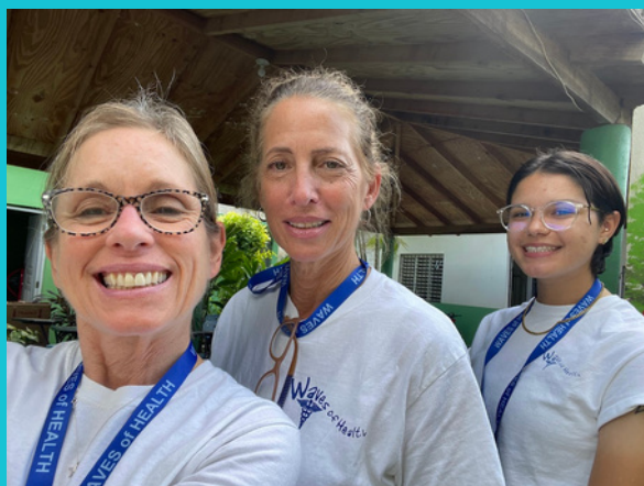
WMS STAFF GO ON MEDICAL MISSIONS